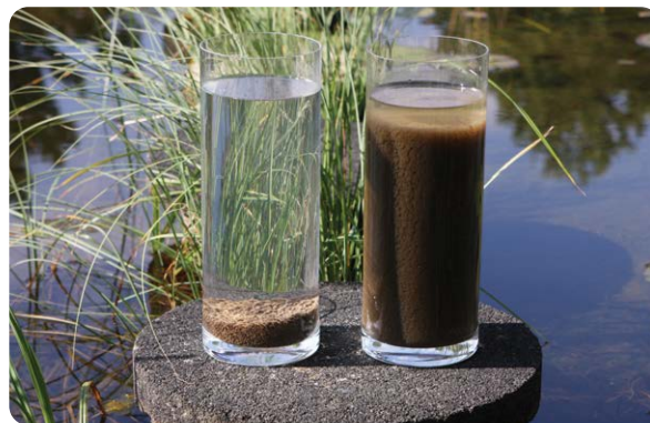
SVI 5 comparison of aerobic granular sludge (left) and conventional activated sludge (right)