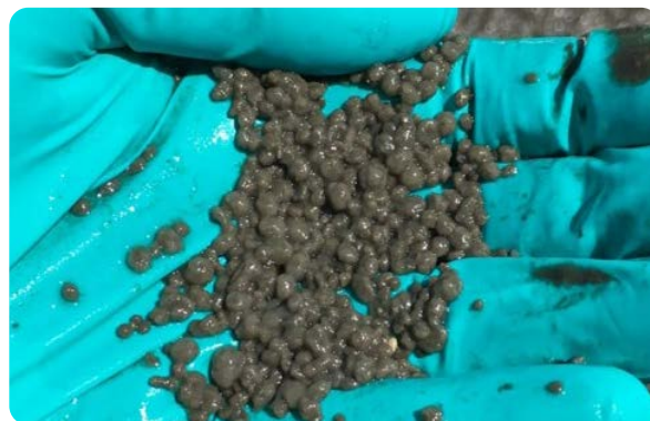
Granule sample following sieve testing at the AquaNereda® demonstration facility, Rockford, IL