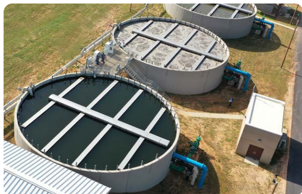
Three AquaNereda® reactors show compact design, typically 50% of a conventional plant.